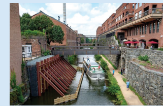
NPS - C&O Canal Georgetown Abutment