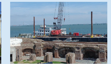
NPS - Ft Sumter Pier Upgrade