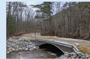
USFS - Sherando Bridge Replacement