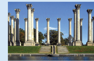
USDA - National Arboretum Stormwater