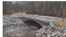
USFS - Sherando Bridge