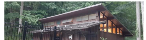
NPS - Catoctin National Historic Park