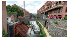
NPS - C&O Canal NHP