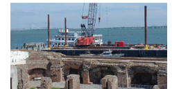
NPS - Fort Sumter NHP