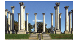
USDA National Arboretum